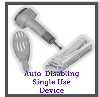
Auto-Disabling Single Use Device